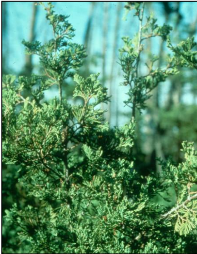
A young Atlantic White Cedar plant.

Atlantic White-Cedar ( Chamaecyparis thyoides ) is the defining species of AWC swamps. Atlantic White-Cedar is an evergreen conifer tree in the Cypress family (Cupressaceae) with short branches and scale-like leaves that form a soft, flat spray. The trees grow up to 80 ft. (25 m) tall, and they have straight trunks, cinnamon-brown to gray peeling bark, and a twisting grain. Although each of the four AWC swamp community types has a characteristic vegetation structure and composition, some plant species co-occur with Atlantic white-cedar in each of the types; these common associates are red maple ( Acer rubrum ), high-bush blueberry ( Vaccinium corymbosum ), swamp azalea ( Rhododendron viscosum ) and Sphagnum spp. moss.